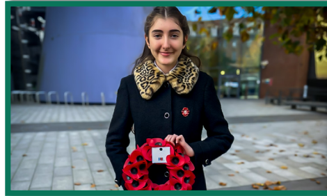
TOP: Miss Ridley delivers an assembly on the importance of Remembrance Day.