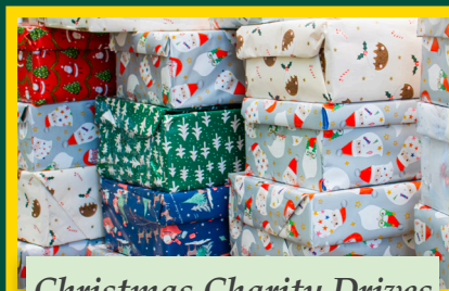
Christmas Charity Drives