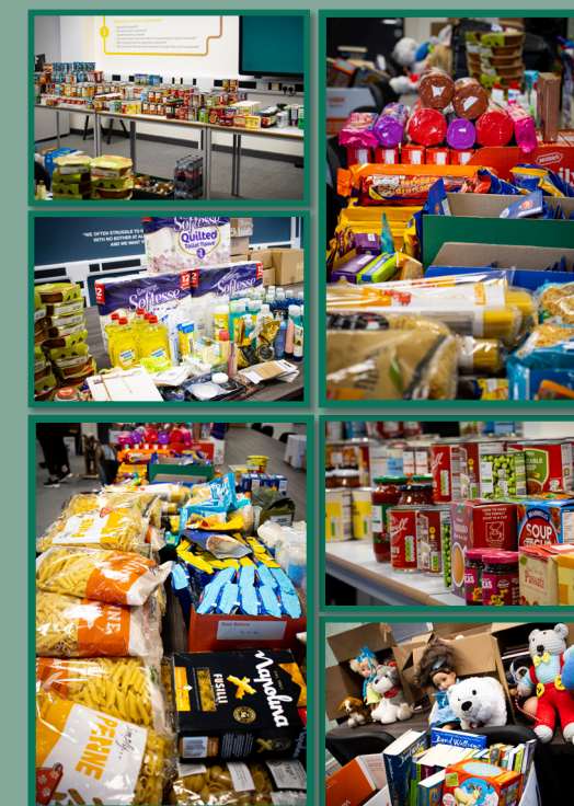
We recieved an astounding amount of donations for The Unity Shop.

Thanks to donations from staff, the wider school community and even businesses that the school liaise and work with, we have managed to accumulate a literal minibus load of donations to go towards helping local families this Christmas.