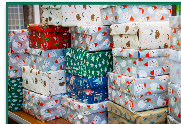
Nearly thirty shoeboxes worth of donations were taking to Age UK.