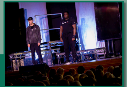
Saltmine Theatre Company

We also welcomed The Riot Act for to Malet Lambert today this September, who performed an amazing piece on the incredibly important message of road safety for our Year 7 pupils.