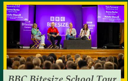
BBC Bitesize School Tour