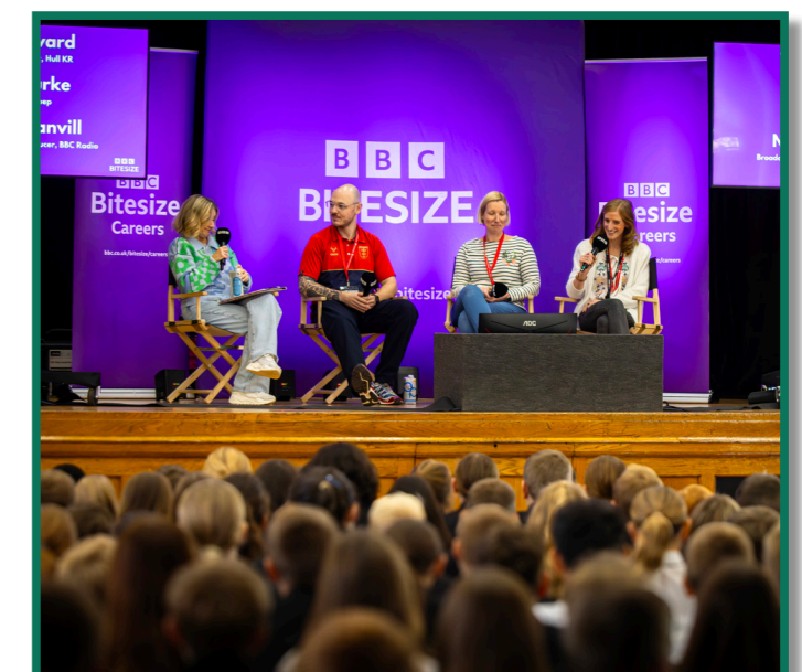
This year's BBC Bitesize Tour came to Malet Lambert