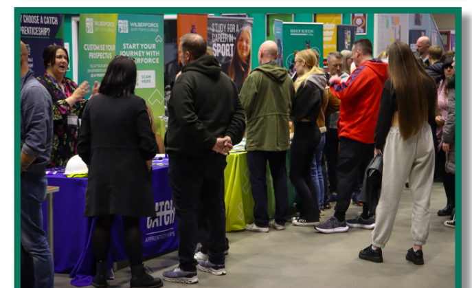
Pupils and Parents/Carers attended our KS4 Information Evening.