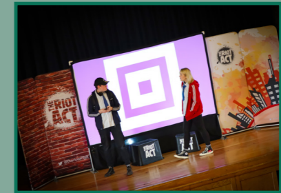
'The Riot Act' performing for our Year 7 pupils.