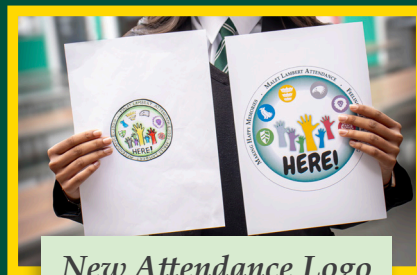
New Attendance Logo