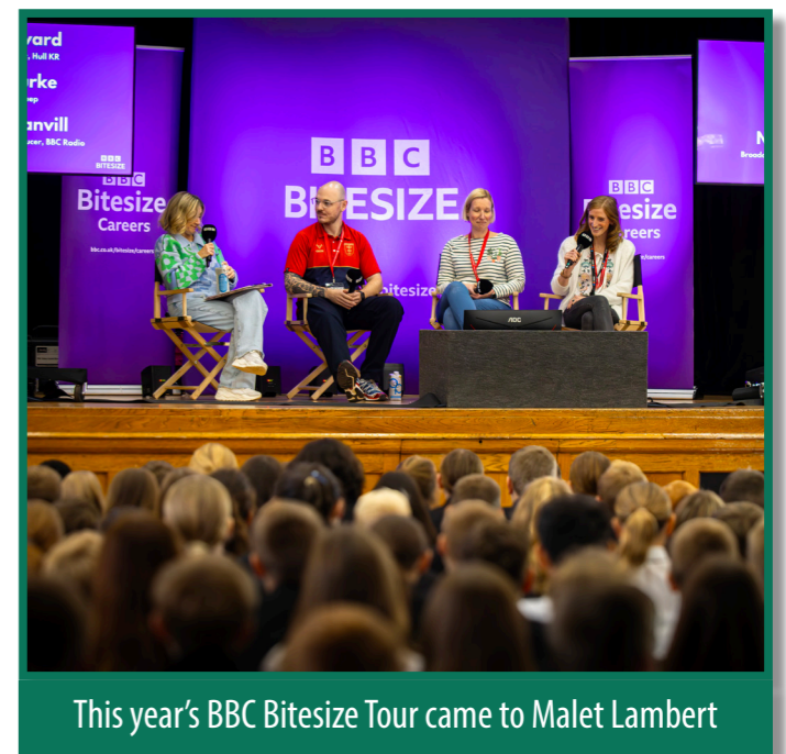
This year's BBC Bitesize Tour came to Malet Lambert