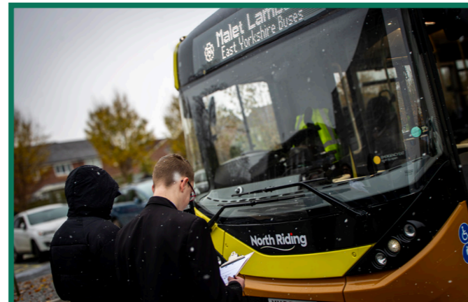
East Yorkshire Buses took our pupils through the proper procedure for a bus safety check.

As our Key Stage 4 pupils consider their options for after they leave Malet Lambert, the school has hosted a number of external visitors from colleges and training providers from around our local area as a chance for our pupils to learn more about the opportunities available to them, post-GCSE.