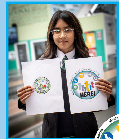
Our new attendance logo.