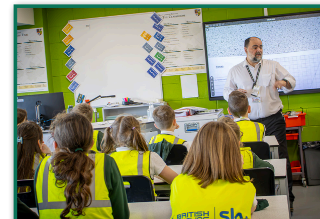
Year 5 pupils from Ings Primary School took part in a science workshop at Malet Lambert.

Pupils were able to work within one of our science labs and were supported by some of our Year 7 pupils to help complete their investigations. The pupils were a credit to their school and we hope that they enjoyed their experience of science at Malet Lambert.