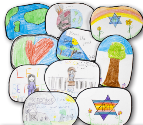
Stone designs by Malet Lambert Pupils.