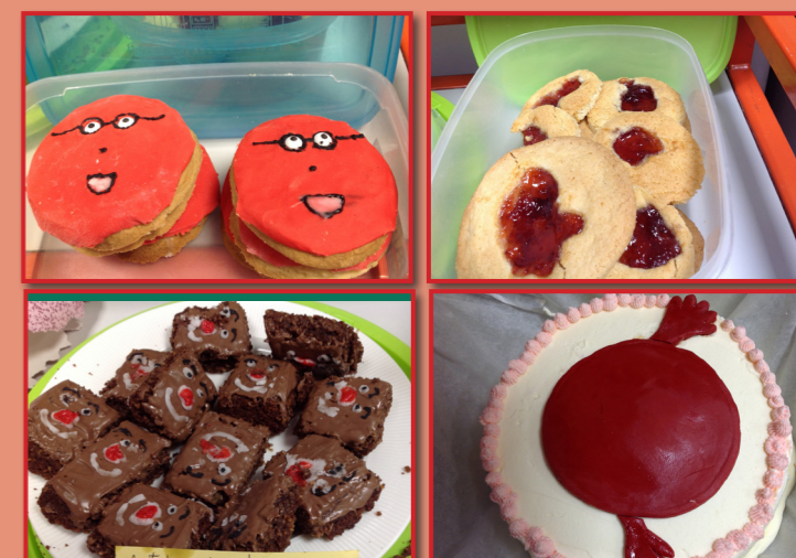
Pupil-baked cakes were sold to raise money for Comic Relief.

runners up were all invited to receive their prizes from the Food Department. Thank you to all of the staff and pupils who contribute to a fantastic Red Nose Day.