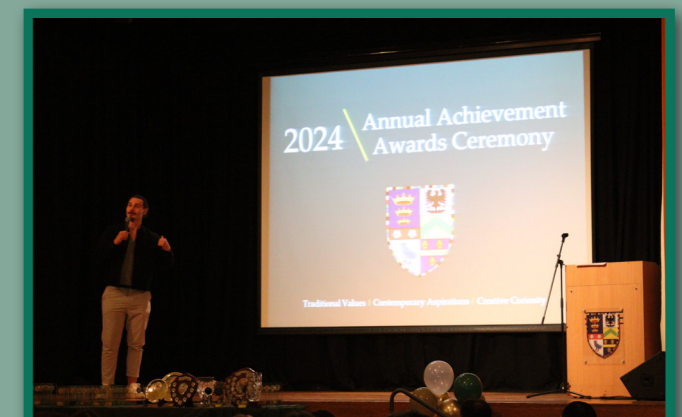
Pupils and Parents/Carers attended our Leavers Achievement Evening.