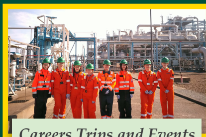
Careers Trips and Events