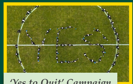
'Yes to Quit' Campaign