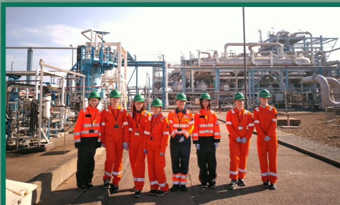
Malet Lambert pupils visited Centrica Gas Terminal this term.

Also this term, our Year 9 Geography Pupils were taken to Drax Power Station and shown all around the turbines, generators and control room.